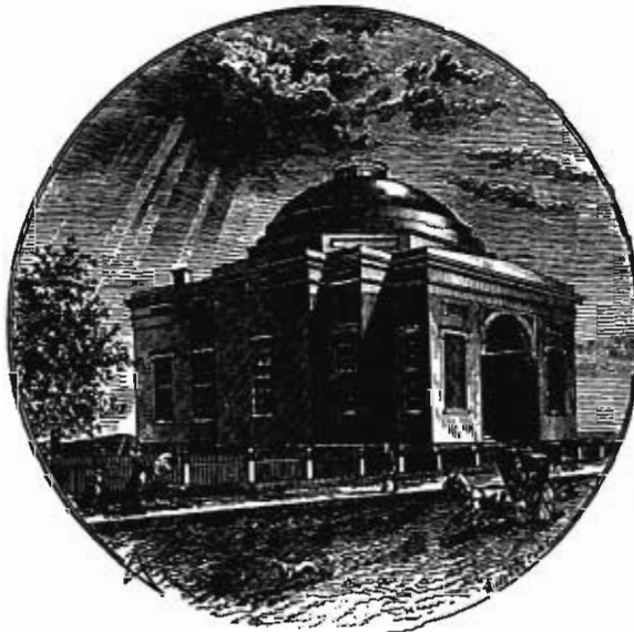
FIRST RUSH MEDICAL COLLEGE.